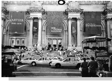
THE METROPOLITAN MUSEUM OF ART "The Met"

A gigantic New York City museum with art from all over the world and from all time periods.